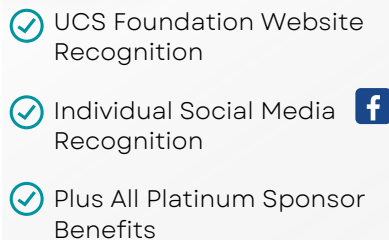
TABLE // $250